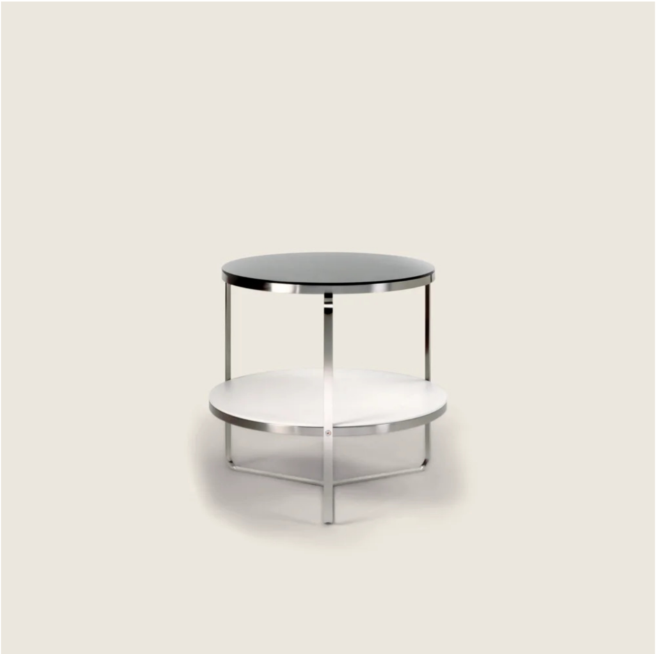
CARLOTTA ANTONIO CITTERIO 1996 COFFEE AND SIDE TABLES