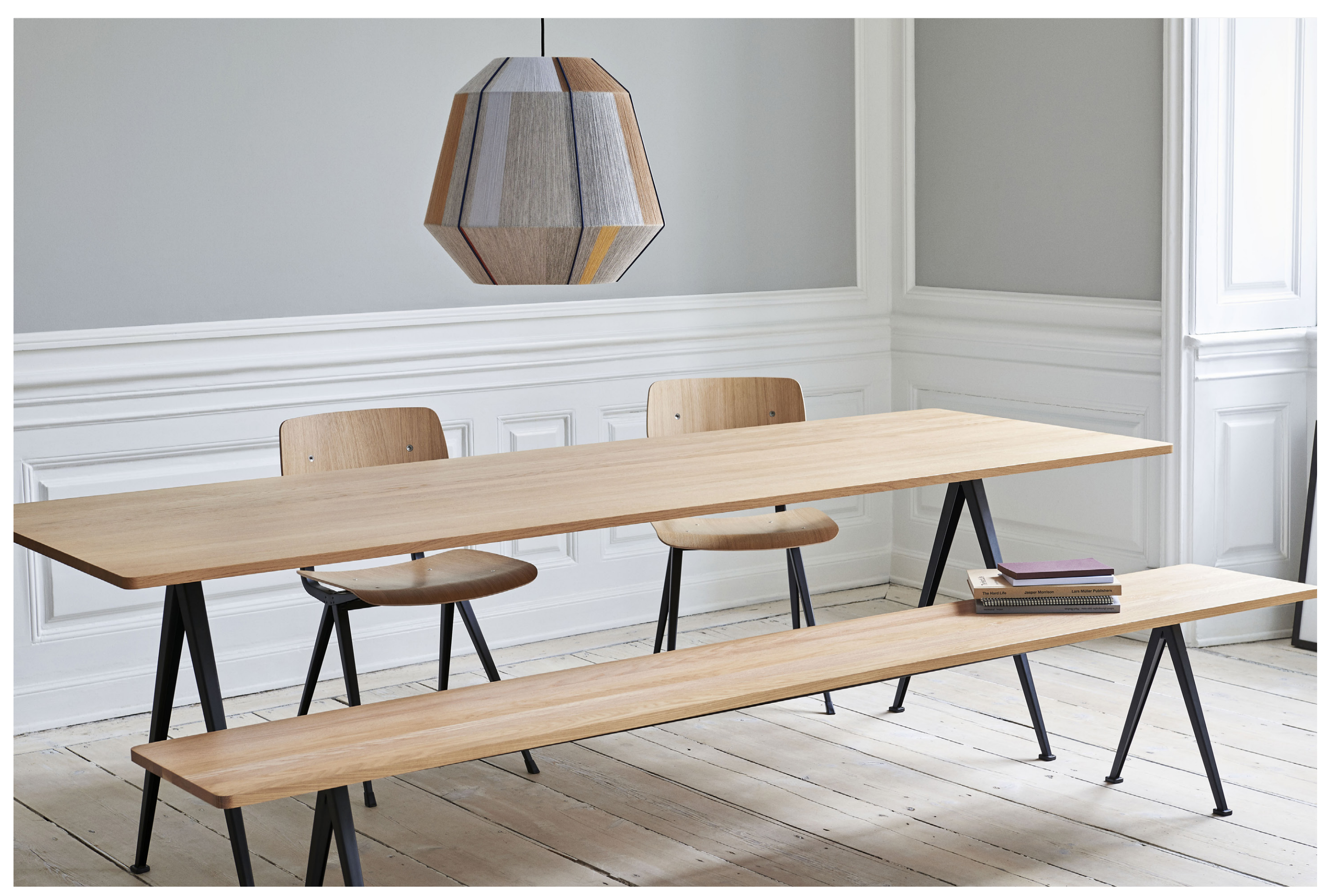
Pyramid Bench 12 | Water-based lacquered benchtop | Black powder coated frame