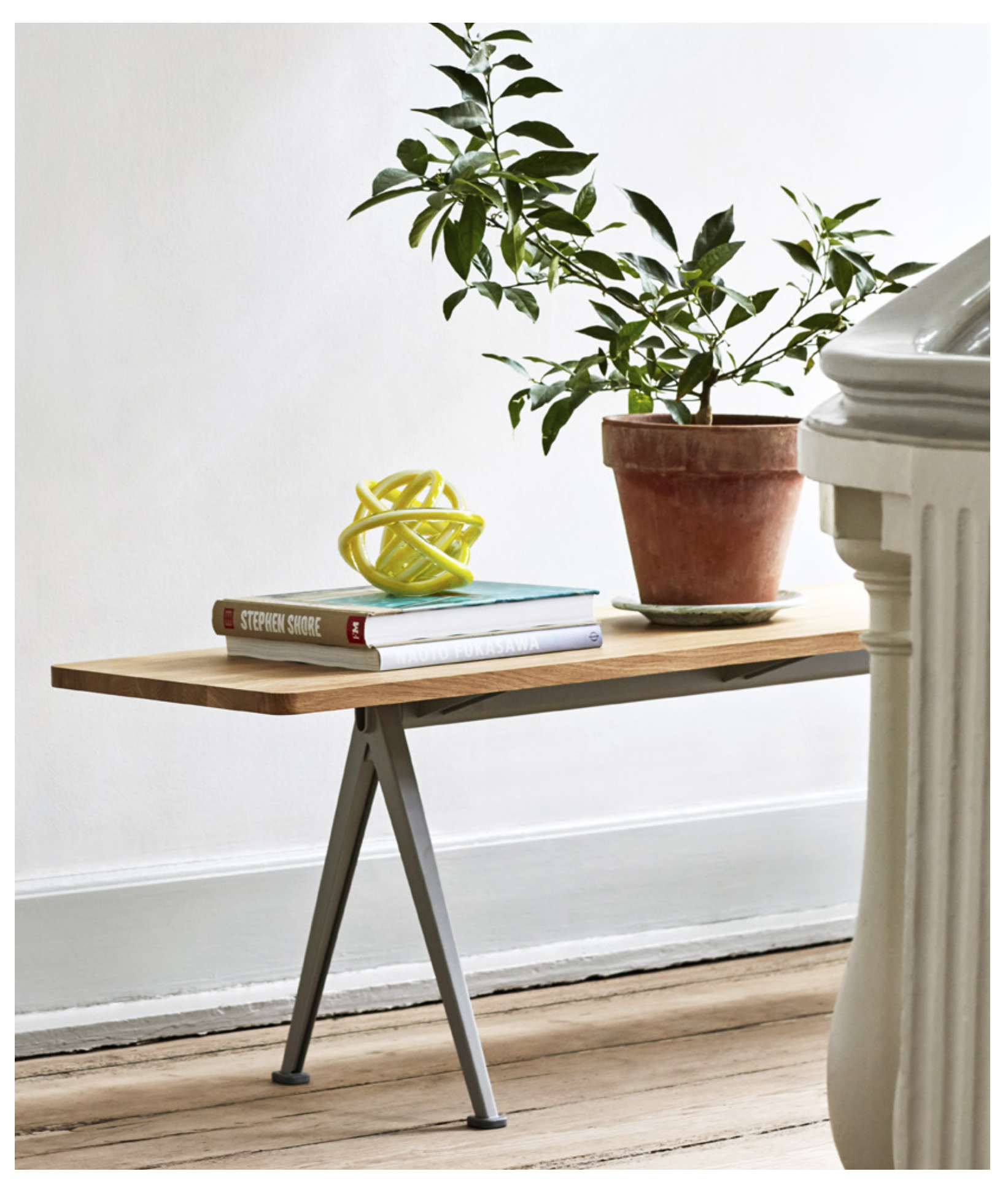
Pyramid Bench 12 | Water-based lacquered benchtop | Beige powder coated frame