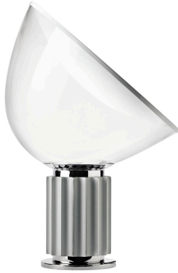
Table lamp providing indirect and reflected light. Reflector in painted aluminium, gloss white on the outside and matt white on the inside. Directionable diffuser in transparent PMMA. Body in matt black or naturally anodized extruded aluminium. Base in nickel-plated metal. Electric cable of useful length 220 cm, with dimmer switch for ON/OFF and adjustment of the light flow between 10-100%. Plug-in power supply with interchangeable plugs.

by Achille & Pier Giacomo Castiglioni , 1962