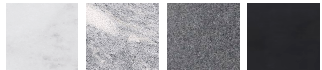
MARBLE (ROLLED) WHITE MARBLE (ROLLED) GREY-WHITE GRANITE SLATE*