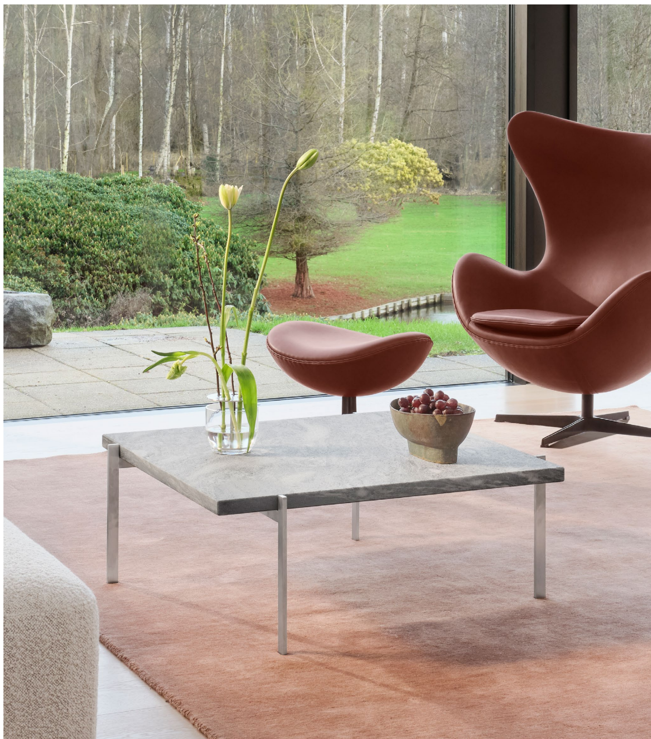
PK61™ & PK61A™ PRODUCT FACT SHEET