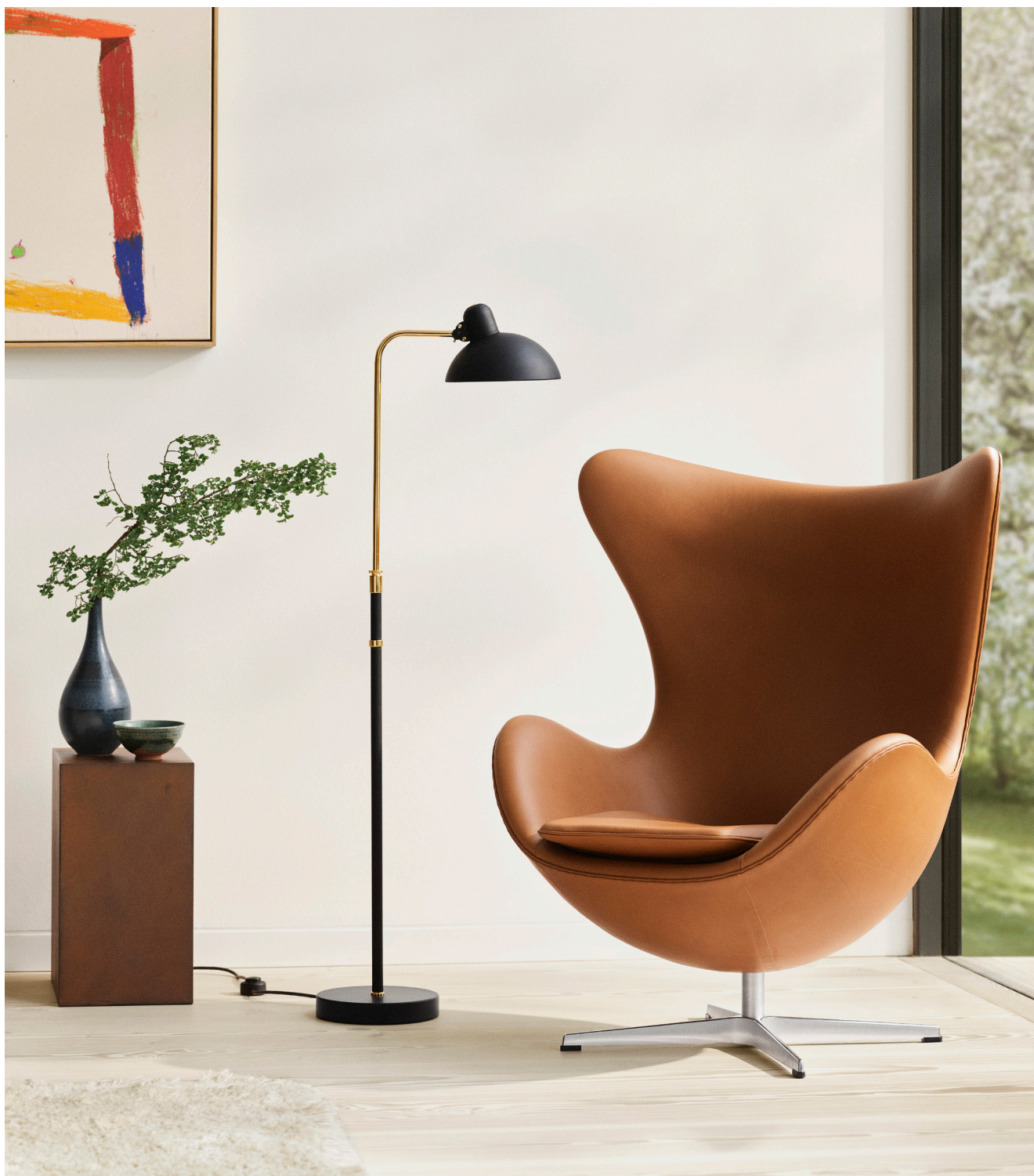
KAISER idell™ 6580-F PRODUCT FACT SHEET