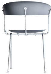
Frame: Galvanized Seat and Back: Metallised Grey 1761 C