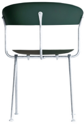
Frame: Galvanized Seat and Back: Dark Green 1555 C