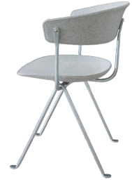
Frame: Galvanized Seat and Back: Light Grey Divina Mélange (120)