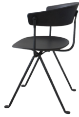
Frame: Black Seat and Back: Black Beech