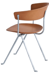
Frame: Galvanized Seat and Back: Natural Leather L-0090