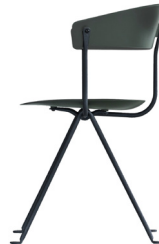
Frame: Black Seat and Back: Dark Green 1555 C