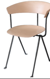
Frame: Black Seat and Back: Natural Beech