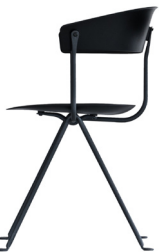
Frame: Black Seat and Back: Black 1763 C