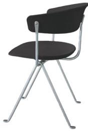
Frame: Galvanized Seat and Back: Dark Grey Divina MD (193)