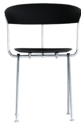
Frame: Galvanized Seat and Back: Black 1763 C