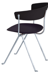
Frame: Galvanized Seat and Back: Black Leather L-0060