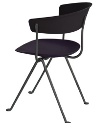
Frame: Black Seat and Back: Black Leather L-0060