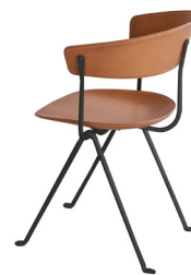
Frame: Black Seat and Back: Natural Leather L-0090