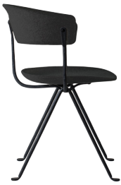
Frame: Black Seat and Back: Dark Grey Divina MD (193)