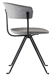
Frame: Black Seat and Back: Light Grey Divina Mélange (120)