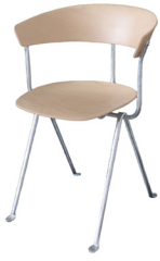
Frame: Galvanized Seat and Back: Natural Beech