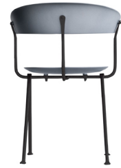
Frame: Black Seat and Back: Metallised Grey 1761 C