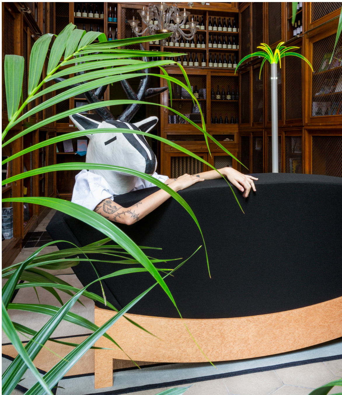
↪ Contemporary Cluster, Palazzo Brancaccio, Rome. 2021