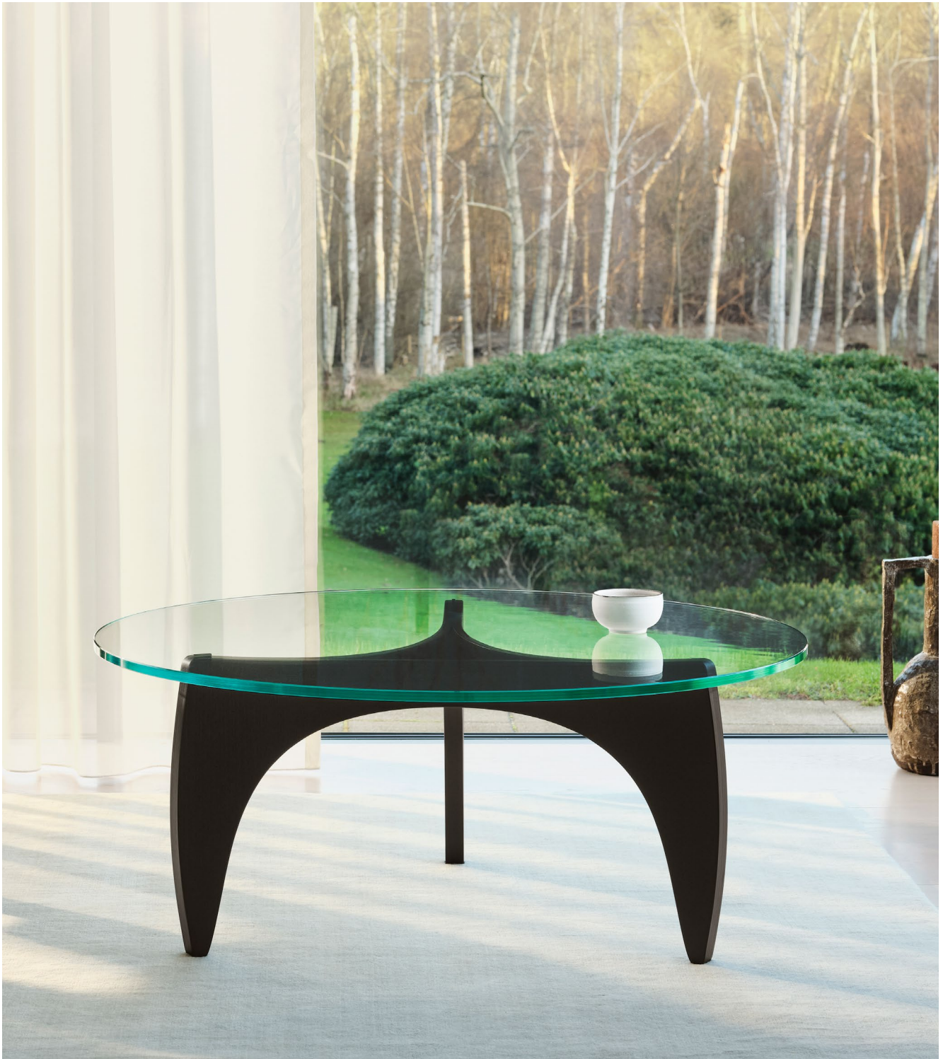
PK60™ PRODUCT FACT SHEET