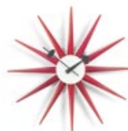
Sunburst Clock, red, Ø 470