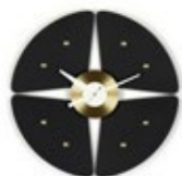
Petal Clock, black/brass, Ø 448