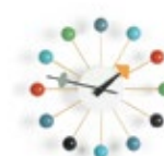
Ball Clock, multicoloured, Ø 330