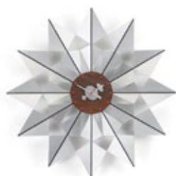
Flock of Butterflies, aluminium, Ø 610