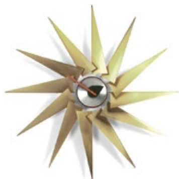
Turbine Clock, brass/aluminium, Ø 765