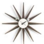
Sunburst Clock, walnut, Ø 470