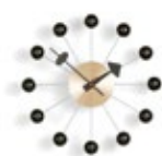
Ball Clock, black/brass, Ø 330