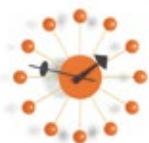
Ball Clock, orange, Ø 330