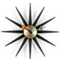
Sunburst Clock, black/brass, Ø 470