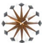
Polygon Clock, walnut, Ø 430