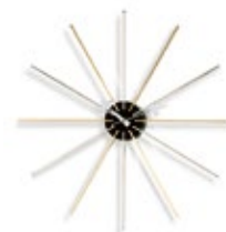
Star Clock, chrome/brass, Ø 610