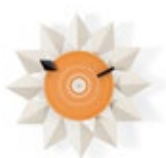
Diamond Markers Clock, white, Ø 335