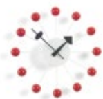
Ball Clock, red, Ø 330