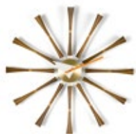
Spindle Clock, walnut/brass, Ø 577