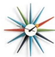
Sunburst Clock, multicoloured, Ø 470