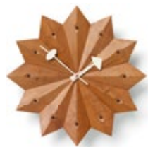
Fan Clock, cherry (USA), Ø 384