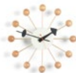
Ball Clock, beech, Ø 330