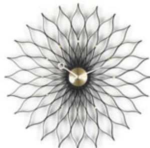
Sunflower Clock, black ash/brass, Ø 750