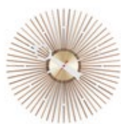
Popsicle Clock, walnut, Ø 350