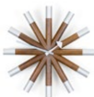
Wheel Clock, walnut/aluminium, Ø 455