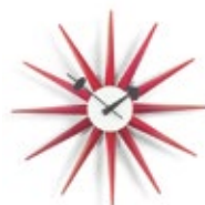
Sunburst Clock, red, Ø 470