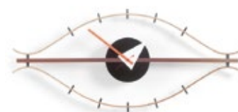
Eye Clock, brass/walnut, H 340 x W 760