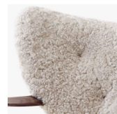
Sheepskin Moonlight 17mm