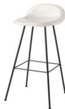
// White Cloud