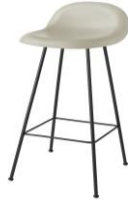
// Moon Gray