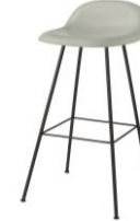
// Nightfall Blue