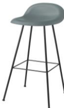
// Rainy Gray