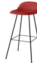
// Shy Cherry