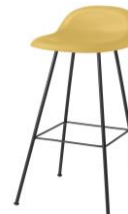
// Venetian Gold