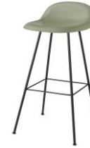
// Mistletoe Green